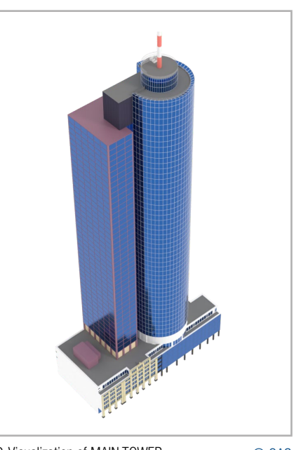
3D-Visualization of MAIN TOWER.